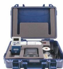
Our GK kit comes complete with a 34 liter dry gas tank for easy calibration and calibration checks for your EBT.