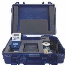
Pairing the Phoenix 6.0BT with our PermaAffix label printer in rugged sturdy case is a simple solution for your alcohol testing needs.