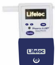
Antimicrobial cases protect from bacteria due to residual saliva residue. No slip grips offer additional protection from drops and falls.

When used with the optional EASYCAL® automatic calibration station, the Phoenix 6.0BT provides for automatic instrument calibration and cal-checking, record retention and gas management.